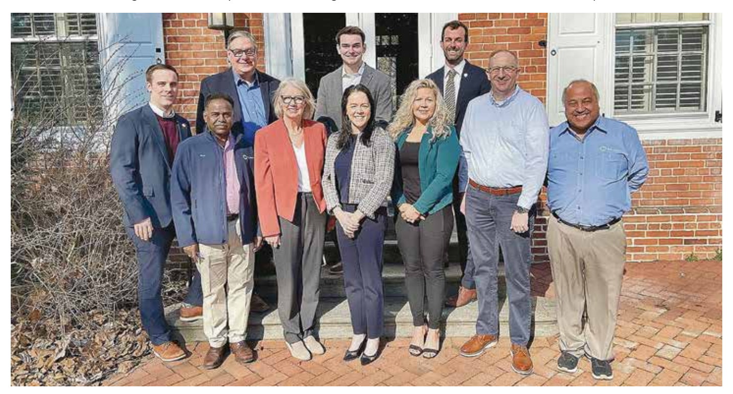
The picture above is from the Council on Development Finance meeting where FFI Ionix received the approval of the Graduated Lab Space Grant.

Through their long-term presence and capital investments, companies like FFI lonix demonstrate their unwavering commitment to fostering economic growth and creating valuable opportunities for the community. This underscores Kent County's reputation as an exceptional location for businesses to thrive, thanks to its supportive ecosystem, skilled workforce, and strategic partnerships. Such success is further facilitated by the support and strategic initiatives of organizations like the Kent Economic Partnership, dedicated to driving economic growth in Kent County through business attraction, retention, and expansion.